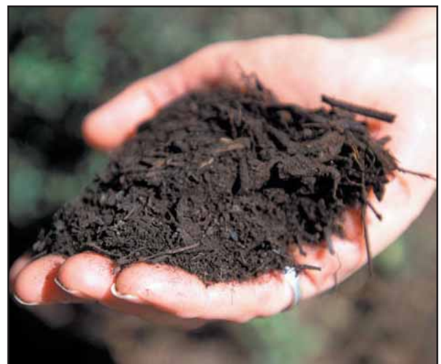
Follow-up the Soils, Composting and Fertilization class with a Master Composting Class at the Civic Garden Center.