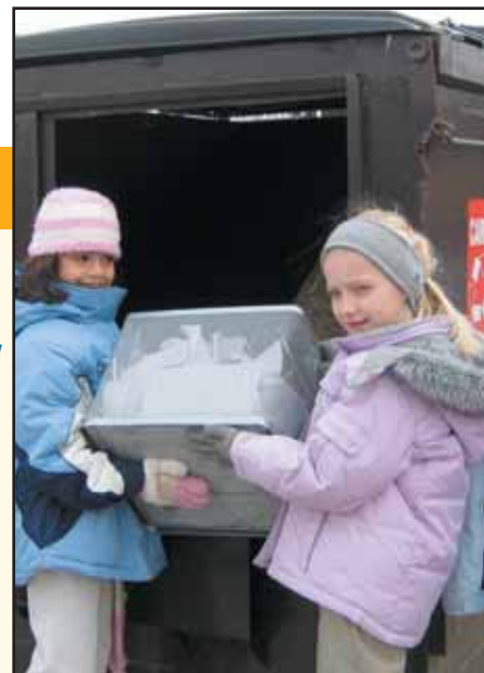
Students recycling paper at St. Aloysius Gonzaga School.

Students at the Bridgetown school received $1,275 to cover the monthly servicing fee for a Rumpke recycling container, a concrete slab for the container and classroom collection bins.